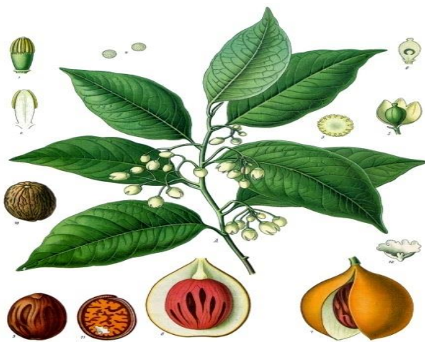
The Mace of Nutmeg

http://en.wikipedia.org/wiki/Mace_(spice)