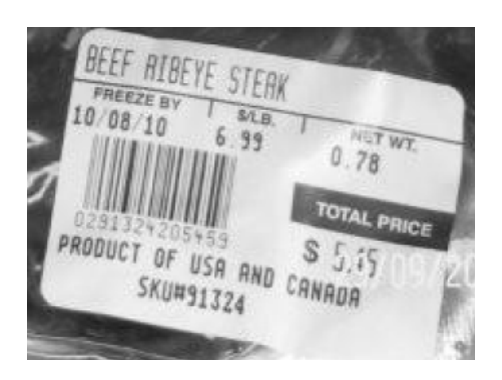
Figure 2. Samples of Label B submitted by Canada and by the United States 405