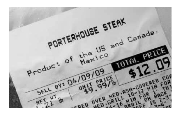
Figure 3. Sample of Label C submitted by the United States 406