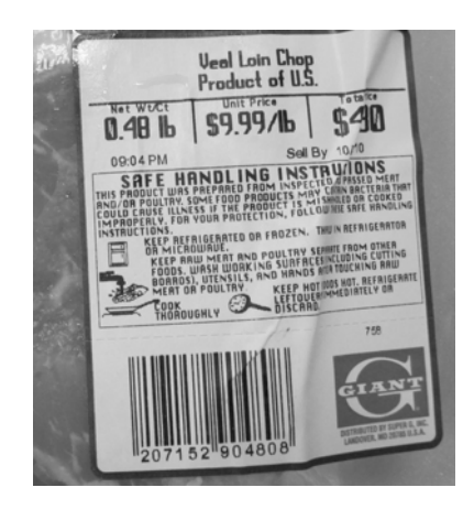
Figure 1. Samples of Label A submitted by Mexico and by the United States<sup>404</sup>

248. The Panel included in its Reports some photographs submitted by the parties showing samples of Labels A, B, and C.