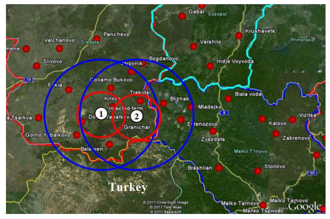
Legend: The location of outbreak 4 (indicated as "1" in picture) and of the location of outbreak 5 (indicated as "2" in the picture)